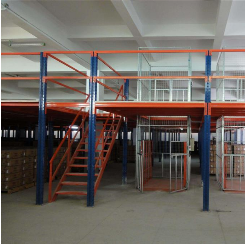
Packaging & Shipping