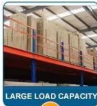
LARGE LOAD CAPACITY