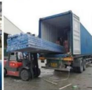
Loading for Wire Mesh Cage