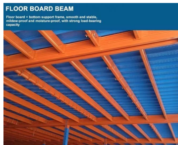
FLOOR BOARD BEAM Floor board + bottom support frame, smooth and stable, moisture-proof and moisture-proof, with strong load-bearing capacity.