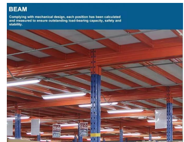
BEAM Complying with mechanical design, each position has been calculated and measured to ensure outstanding load-bearing capacity, safety and stability.