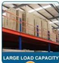
LARGE LOAD CAPACITY