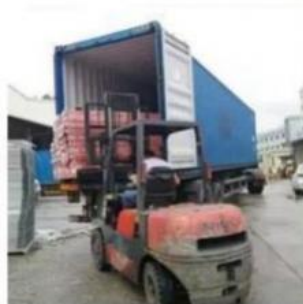
Loading for Beam