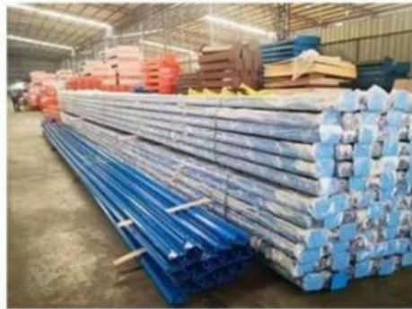
Package for Upright Frame