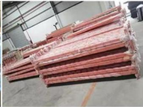
Package for Beam