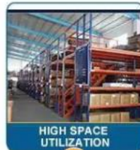
HIGH SPACE UTILIZATION