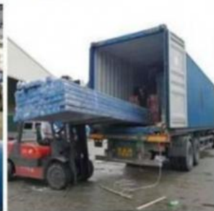
Loading for Wire Mesh Cage