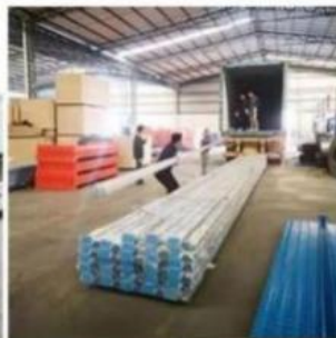
Loading for Upright Frame