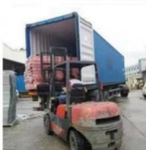
Loading for Beam