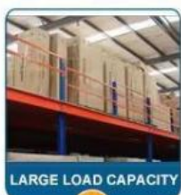
LARGE LOAD CAPACITY