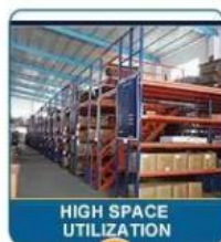
HIGH SPACE UTILIZATION