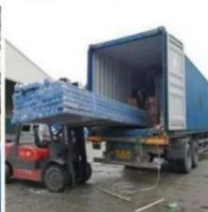
Loading for Wire Mesh Cage