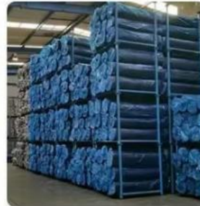
fabric roll storage