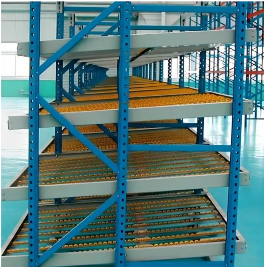
Packaging & Shipping