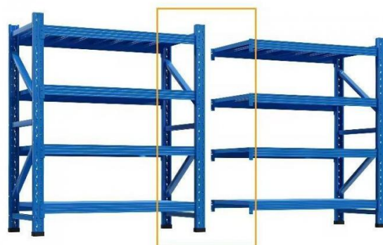
Main frame and sub frame share one column

The main frame has two columns frames, which can be used independently, Add on rack cannot be used alone, which must be used with the main rack.