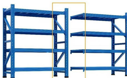
Main frame and sub frame share one column

The main frame has two columns frames, which can be used independently, Add on rack cannot be used alone, which must be used with the main rack.