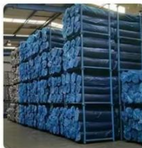
fabric roll storage