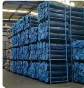
fabric roll storage