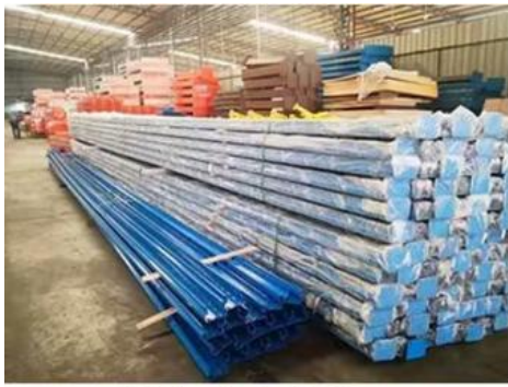
1. Package for Upright Frame