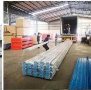
5. Loading for Upright Frame