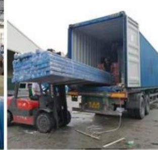
6. Loading for Wire Mesh Cage