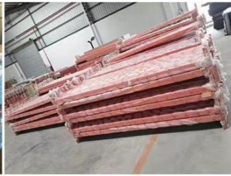
2. Package for Beam