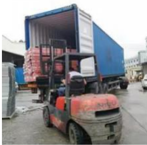
4. Loading for Beam