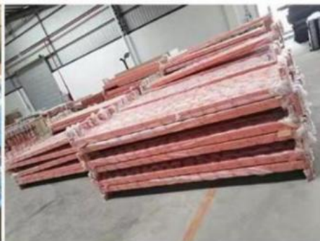
Package for Beam